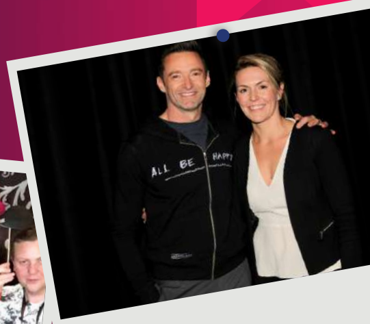
Our winners at the Hugh Jackman World Tour 2019