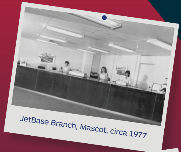
JetBase Branch, Mascot, circa 1977

With only one person in the branch allowed to handle cash and no ATMs or bank cards invented yet. The introduction of the CueCard in 1994 and the first ATM at the Qantas corporate centre and Airport Central Building came as huge milestones not only for the company but for the customers as well, as they were now able to make easier and faster withdrawals.