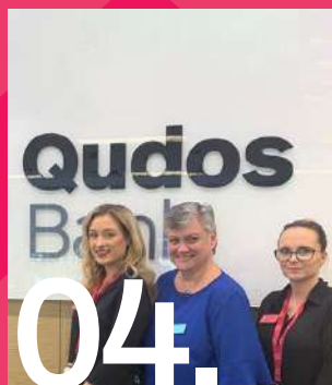
Meet the branch