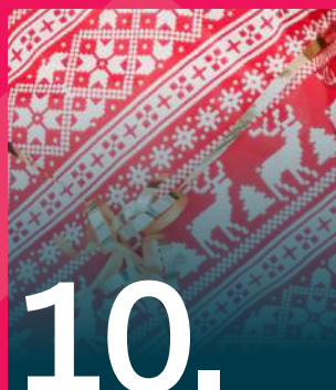
Summer, santa and...savings?!